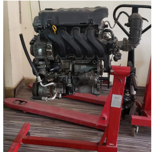
Toyota petrol engine